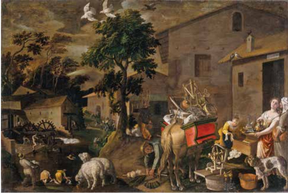
2. Vincenzo Campi, St. Martin's Day , also known as Trasloco ('Moving Home'), post 1572. Painting, 227 x 163 cm. Museo Civico Ala Ponzoni, Cremona.