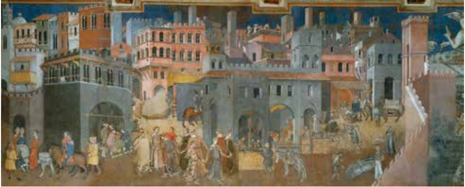
3. Ambrogio Lorenzetti, Allegory of Good Government , ca. 1337–40. Fresco. Palazzo Pubblico, Siena.