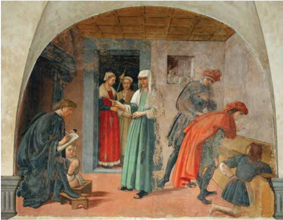
4. Workshop of Domenico Ghirlandaio, Inventory of a Legacy of the Magistrates , late 15th century. Fresco. Florence, San Martino dei Buononimi.

chest, while a notary, on the left, notes down each item found in the house (Illustrations 4 and 5). Since the nature of the document was primarily economic, inventories often recorded items in great detail, mentioning where in the home they were found, their condition, the materials from which they were made, how they were decorated, and to whom they belonged. 63 Although inventories are often labelled as static sources, mere ‘snapshots of reality’ that are fixed in time and unable to capture change (whereas the home was a living entity constantly changing), in actuality, as Giorgio Riello has recently highlighted, inventories are materially rich sources. They provide information on the individual family’s material and economic conditions and daily life, including place of residence, property, the household, taste, furniture, relationship with objects, and religious values. Inventories also represent the family’s capacity to respond to the social and cultural values of time, and to the new patterns of domestic social life and social relationships that were created within the household and beyond. 64