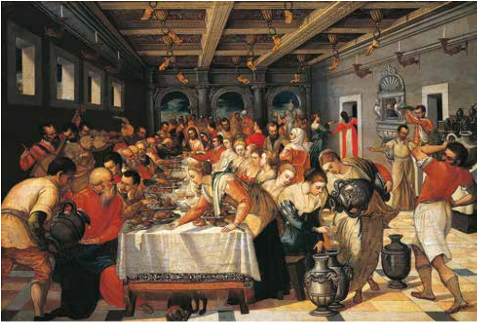
1. Attributed to Michele Damaskinòs, Marriage Feast at Cana , 1560–1570. Painting, 85 x 118 cm. Museo Correr, Venice.

seem warehouses, with so many cloths of every make – tapestry, brocades and hangings of every design, carpets of every sort, camlets of every colour and texture, silks of every kind [...] and so many warehouses full of spices, groceries and drugs. [...] These things stupefy the beholder, and cannot be fully described to those who have not seen them. 4