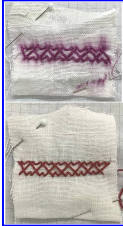
Figure 7. On the top: linen embroidered with silk dyed red with madder and brazilwood, showing how the colour has run and turned pink after treatment with lye. Bottom: unwashed linen embroidered with silk dyed red with madder and brazilwood.