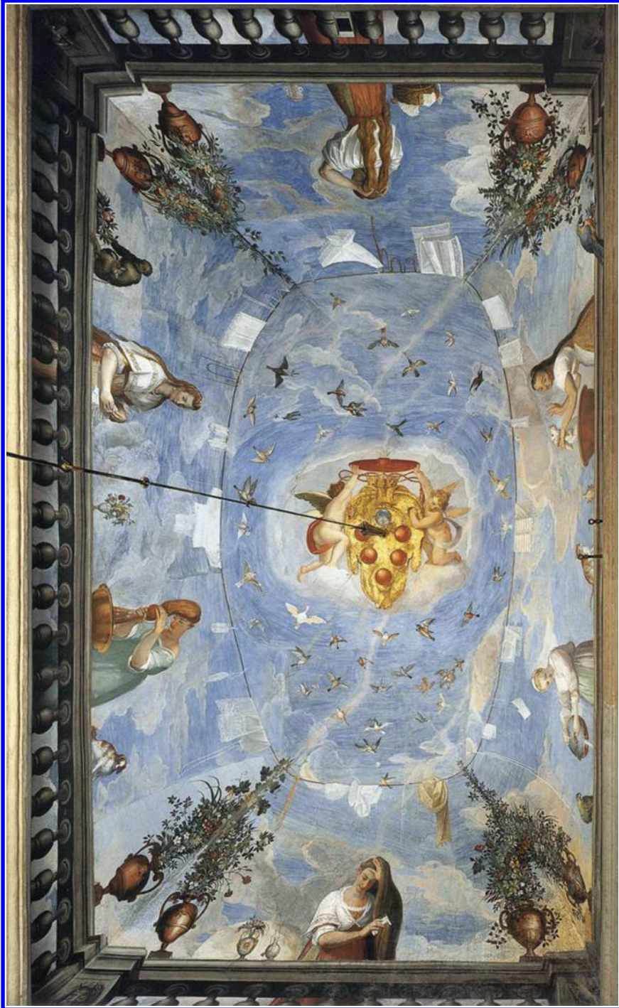
Figure 2. Alessandro Allori, Women at work around a balcony , 1587–90. Fresco. Florence: Palazzo Pitti.