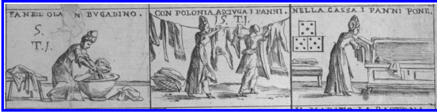
Figure 1. Detail from Giuseppe Maria Mitelli, Gioco delle donne e sue facende ( Game of Women and Their Chores ), c. 1654–1718. Etching, 26.7 × 44 cm. New York, Metropolitan Museum of Art, 52.546.16.