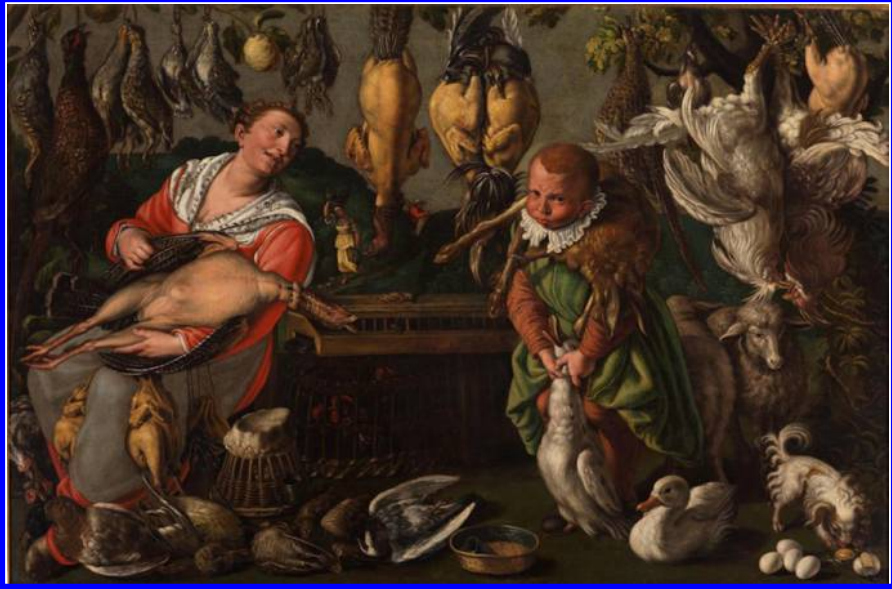
Figure 3. Vincenzo Campi, The Poultry Seller, c. 1578–1581. Oil on canvas, 147 × 215 cm. Milan, Pinacoteca di Brera, 297.