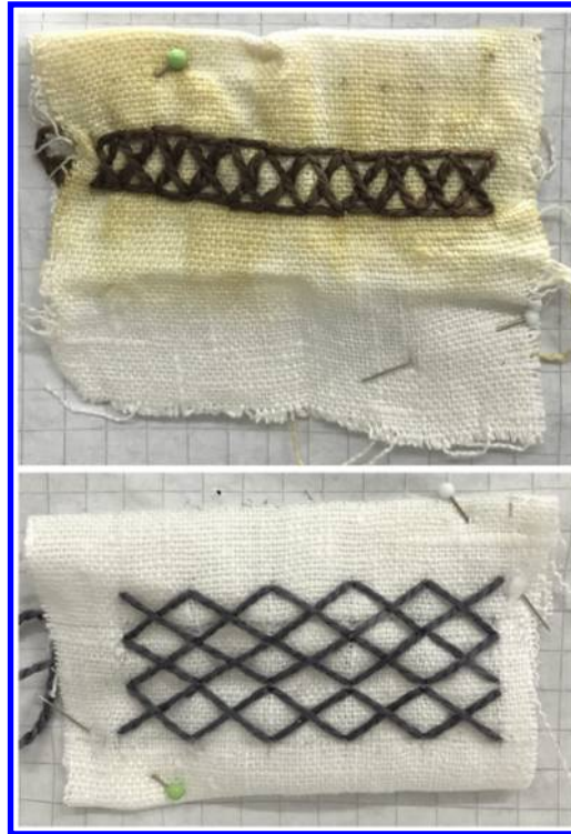
Figure 6. On the top: linen embroidered with silk dyed black with oak galls and iron (II) sulphate, showing how the colour has run and turned brown after treatment with lye. Bottom: unwashed linen embroidered with silk dyed black with oak galls and iron (II) sulphate.