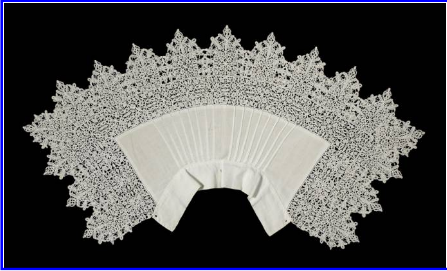
Figure 4. Collar of linen and needle lace, possibly Italian or northern Netherlandish, c. 1625–1640. Linen, 66 × 6 × 10 cm. Amsterdam, Rijksmuseum, BK-1978-462.