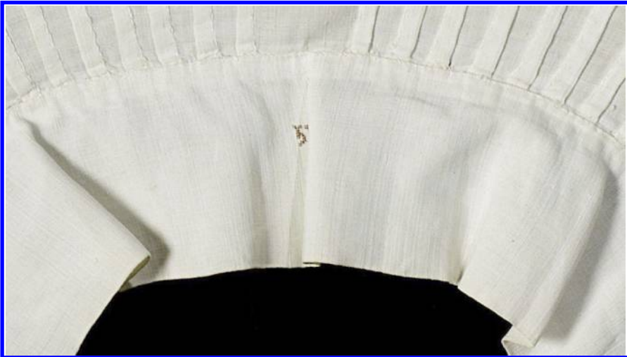
Figure 5. Detail of collar of linen and needle lace, possibly Italian or northern Netherlandish, c. 1625–1640. Linen, 66 × 6 × 10 cm. Amsterdam, Rijksmuseum, BK-1978-462.

washed with the same techniques as un-embroidered linen shirts; early modern dyes were not colour-fast and would run into lighter-coloured fabrics if not cleaned carefully and with attention. This is not apparent in contemporary images or texts, but was established through experimentation using bleached linen embroidered with silk thread dyed with colorants used in the sixteenth